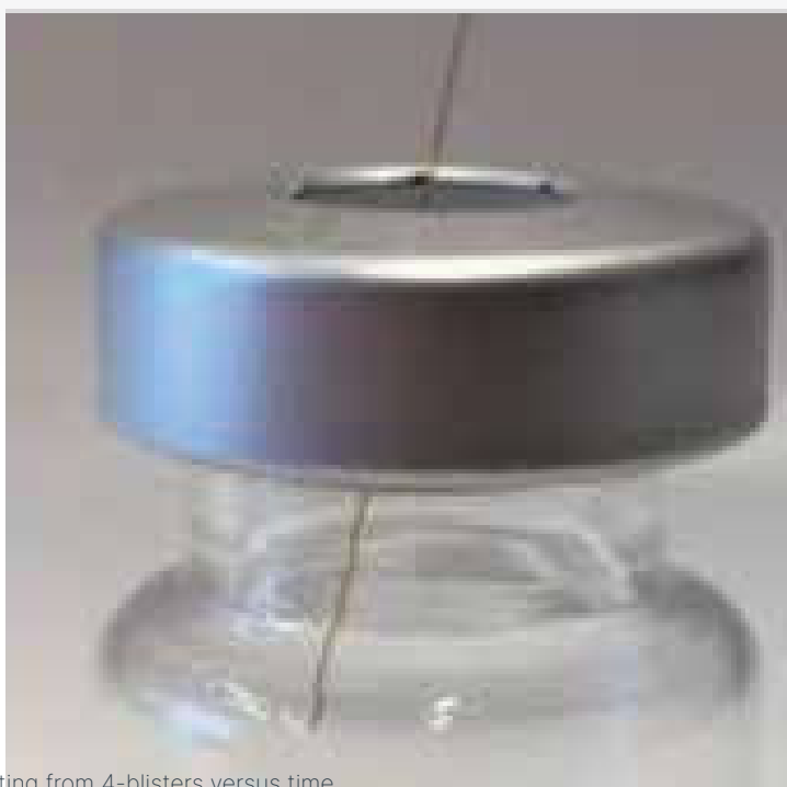
Figure 2: Mass of water permeating from 4-blisters versus time.

Laser-based headspace analysis provides a fast and accurate method to evaluate different blister films and different blister sizes, and the data can be collected at 25°C, 30°C and 40°C as needed.